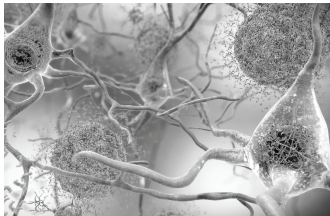
Neuron cells in the brain with amyloid plaques and tau tangles

Scientists are conducting studies to learn more about plaques, tangles, and other biological features of Alzheimer's disease. Advances in brain imaging techniques allow researchers to see the development and spread of abnormal amyloid and tau proteins in the living brain, as well as changes in brain structure and function. Scientists are also exploring the very earliest steps in the disease process by studying changes in the brain and body fluids that can be detected years before Alzheimer's symptoms appear. Findings from these studies will help in understanding the causes of Alzheimer's and make diagnosis easier.